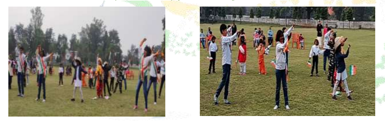
Ravishing Dance Performance by the Kids on Republic Day