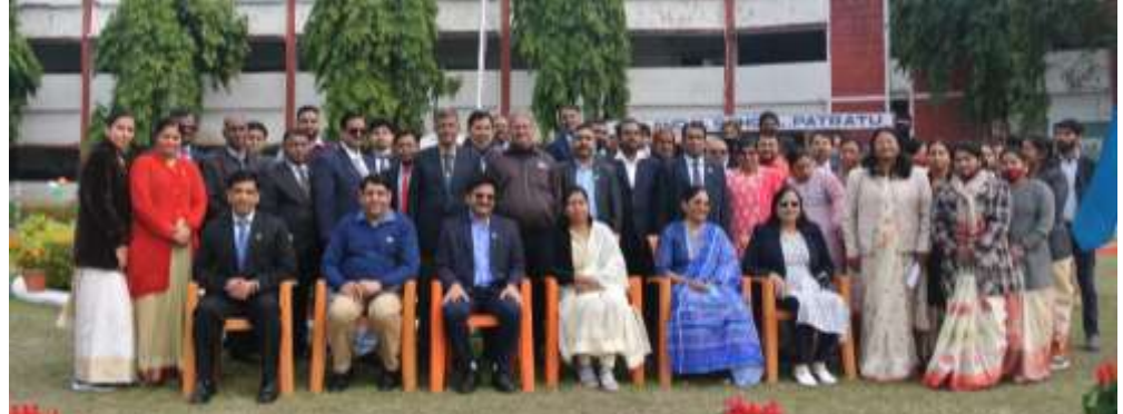
OPJS Family with the Chief-Guest and Dignitaries